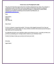
Pre-Approach Letter/Email SD299