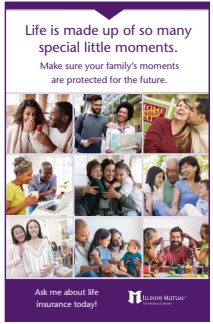
Consumer Poster (Also available in Spanish except in CO) C5723

Order or download these sales tools to show your clients why life insurance can be seen as love insurance .